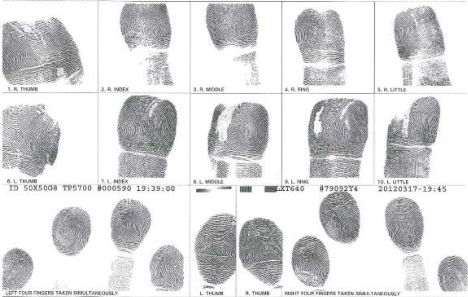
1. R. THUMB